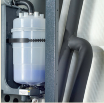
Optional steam humidifier