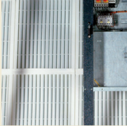
Filter class F5 (EU5)