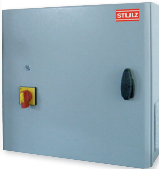
USS slave control unit