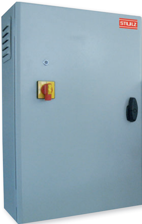
USM master control unit